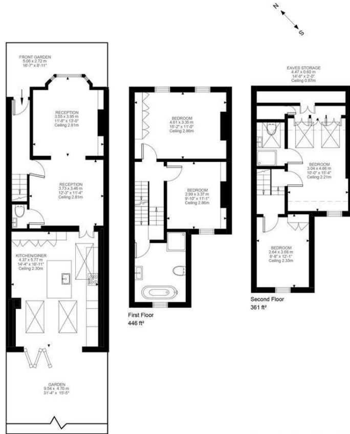
Ground Floor 648 ft 2